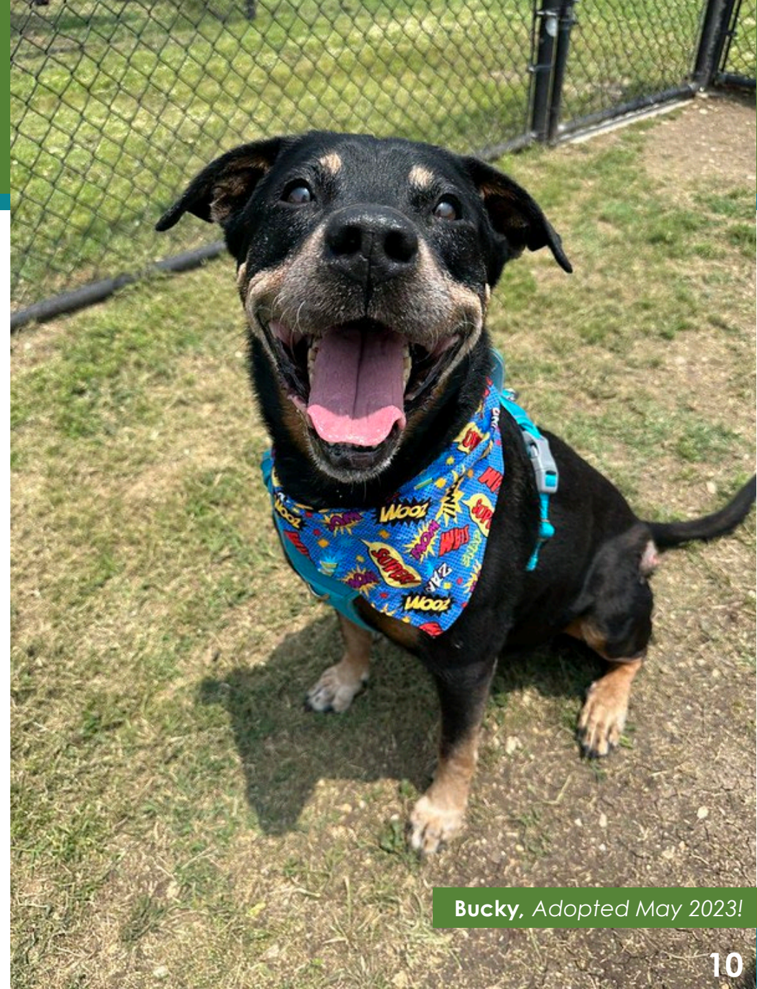
Bucky, Adopted May 2023!