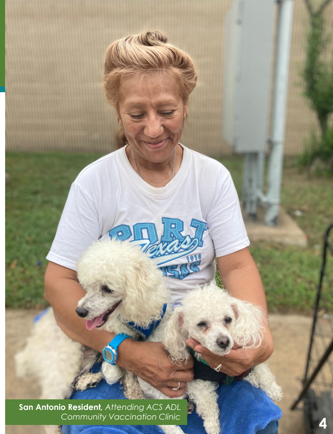
San Antonio Resident, Attending ACS ADL Community Vaccination Clinic