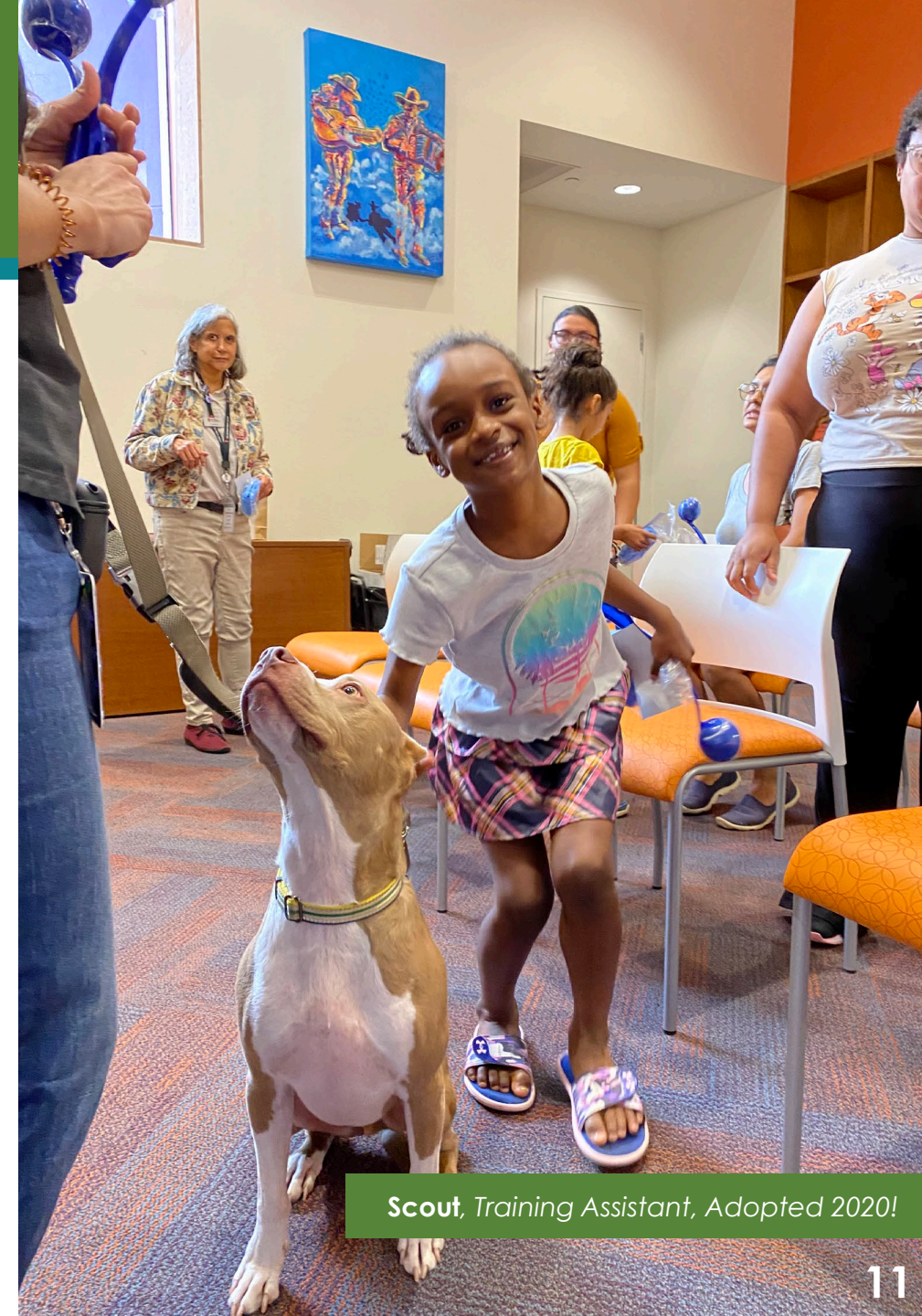
Scout, Training Assistant, Adopted 2020!